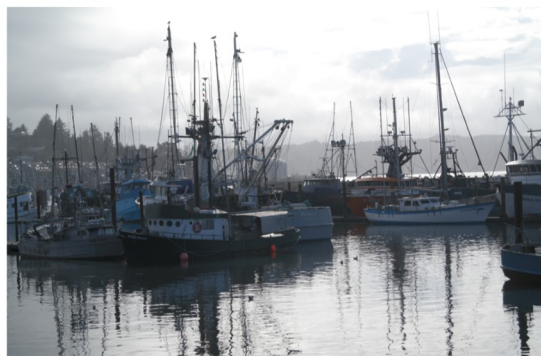
Newport Bay Oregon